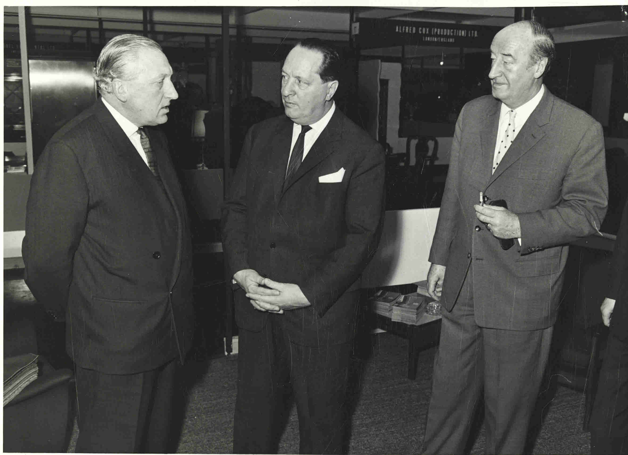
THE MAYOR OF COLOGNE ON OUR STAND AT THE COLOGNE FAIR. FEBRUARY 1964.